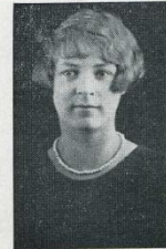
DOROTHY ASHTON Bless thee, Caesar! bless thee! thou art translated.